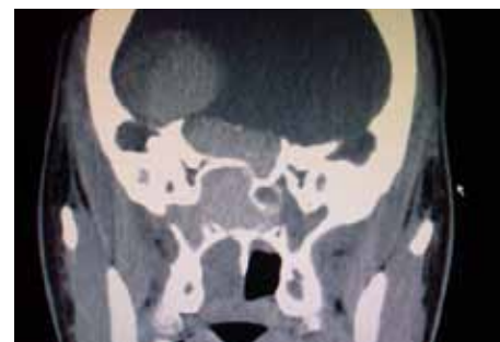
Figure 1a, 1b, 1c: Preoperative sinus CT imaging