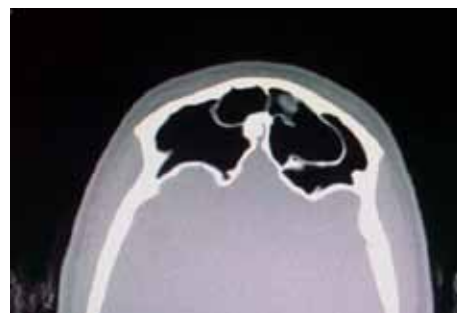
Figure 2a, 2b, 2c: Sinus CT 4 years after surgery